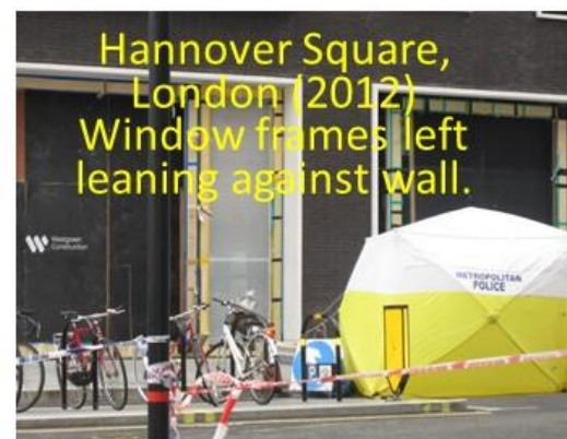
Hannover Square, London (2012) Window frames left leaning against wall.

“ ... fighting for life” “ ... ignored complaints”