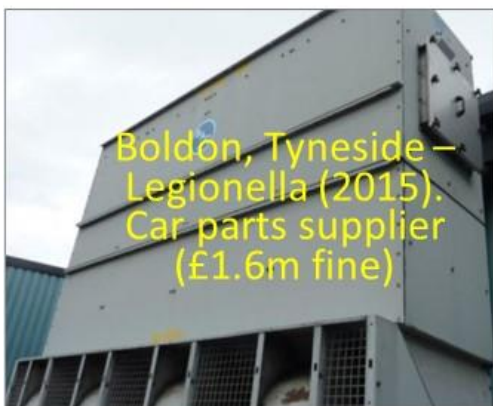
Boldon, Tyneside – Legionella (2015). Car parts supplier (£1.6m fine)

“Design complied with current regulations”