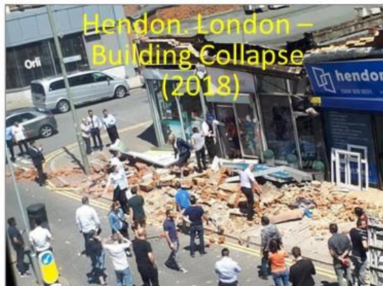
Hendon, London – Building Collapse (2018)