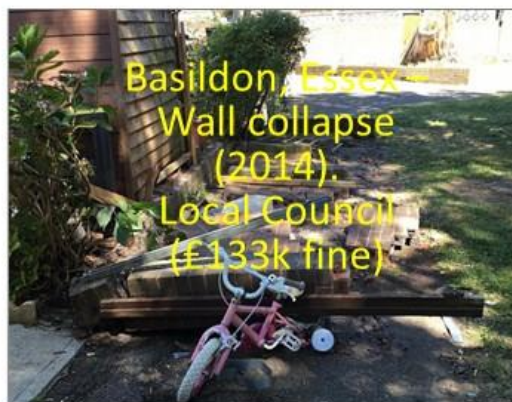
Basildon, Essex – Wall collapse (2014). Local Council (£133k fine)

“ ... fighting for life” “ ... ignored complaints”