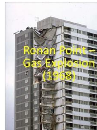
Ronan Point – Gas Explosion (1968)

“Design complied with current regulations”