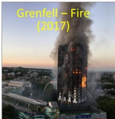
Grenfell – Fire (2017)