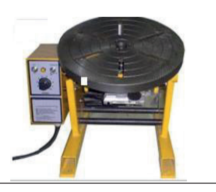
Use turntable, if you can

Minimise work in restricted and confined spaces