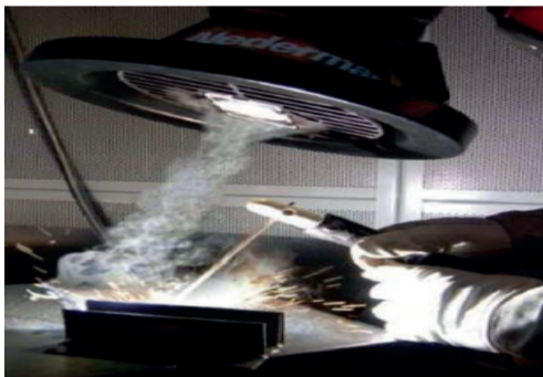
Use extraction. Keep weld area within the capture bubble.