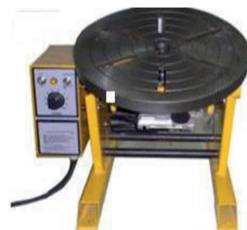
Use turntable, if you can