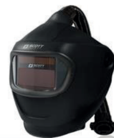
Select the right RPE and use it correctly, where necessary