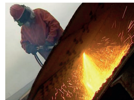
Maximise the use of natural air movement and ventilated spaces