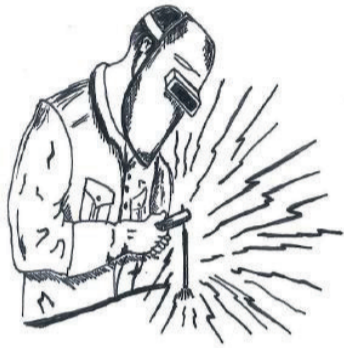
Reduce arcing time