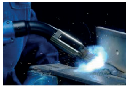
Use on-tool extraction