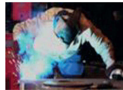
Keep head outside the plume